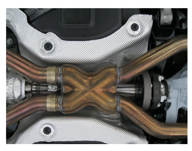
Step 4. Attach the X-Pipe Assembly to the Resonator Assemblies using the supplied 2.50" clamps.