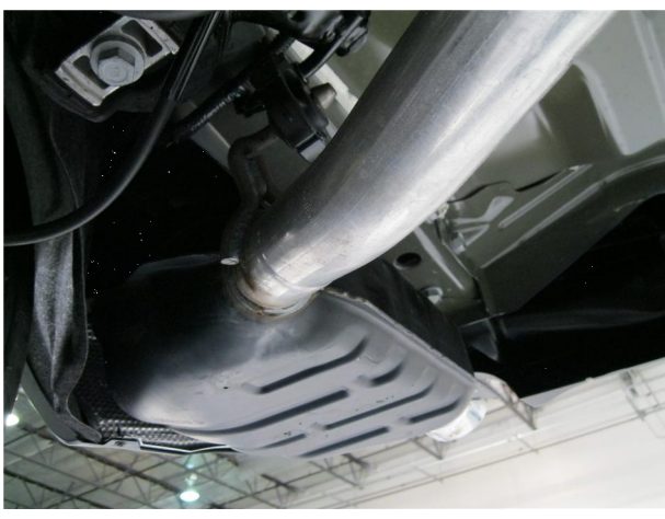
Step 2. Working rearward disengage the remaining hangers from the rubber insulators while supposrting the system. Once all hangers are free you can remove the OEM system.