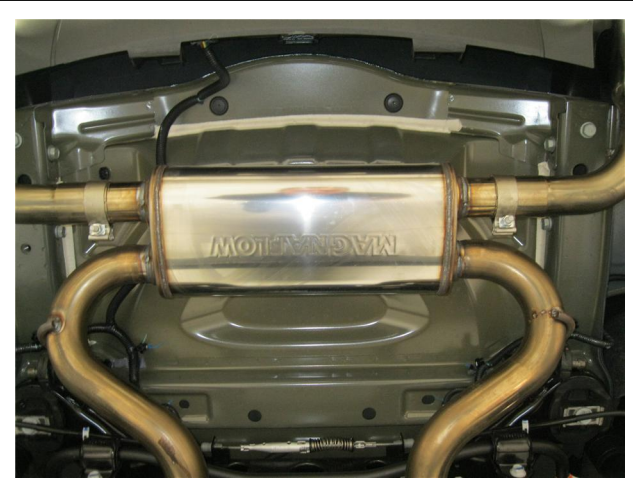
Step 5. Next install the Muffler Assembly to the X-Pipe Assembly using the supplied 2.50" Clamps and fit the hangers into the rubber insulators.