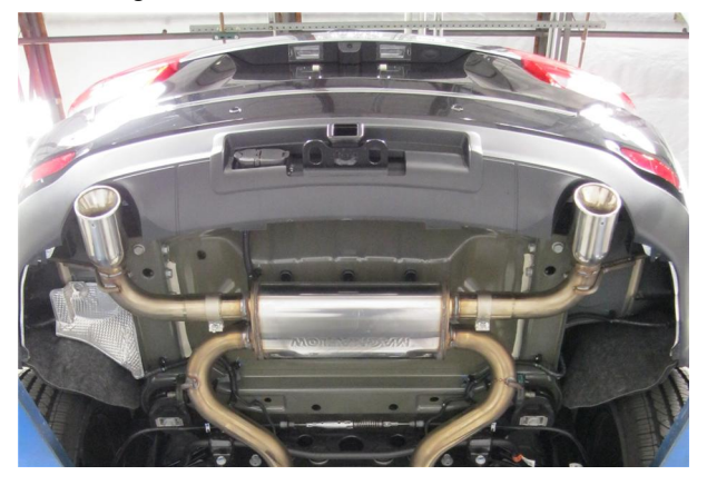
Step 6. Next install the Tailpipe Assemblies using the supplied 2.50" Clamps and fit the hangers into the rubber insulators.