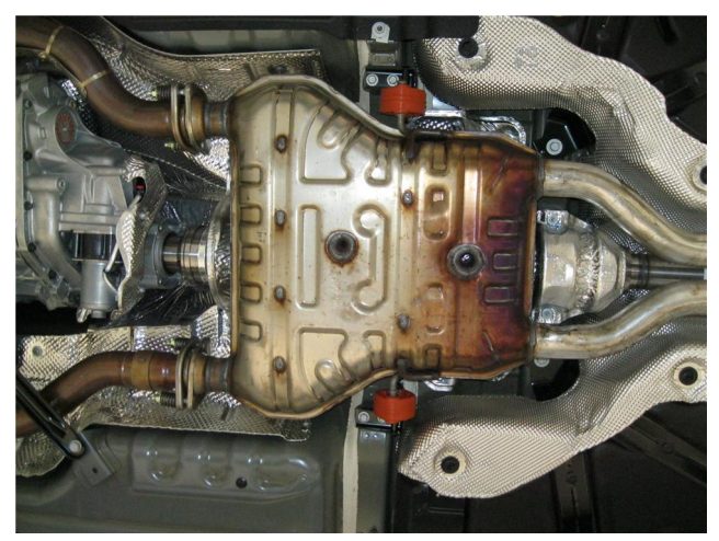
Step 1. Begin removal of the OEM exhaust system by unfastening the spring loaded flanges in front of the OEM resonator and disengaging the hangers from the rubber insulators. Retain all hardware and rubber insulators as they will be re-used to install the new Magnaflow system.