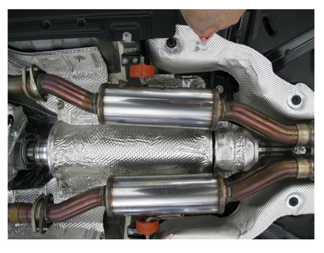
Step 3. Begin installation of the new Magnaflow system by using the supplied M10 bolts and OEM nuts to attach the Driver and Passenger Side Resonator Assemblies to the catalytic converter outlets.